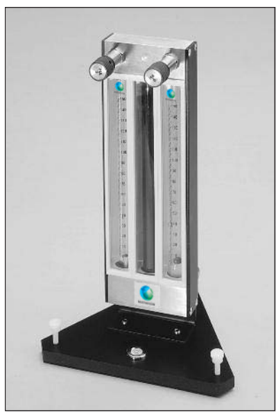
Model 7300 Series