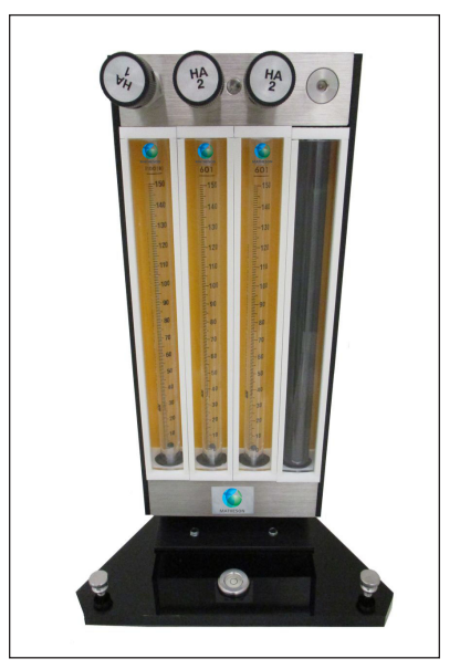
Model 7400 Series

Tubes are available in several 150mm reference scale flow ranges. Be sure to request calibration data for the gases you will be metering. All tubes are supplied with a single glass float.