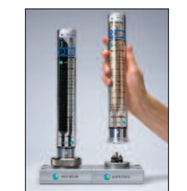
Easy to change cartridge. No tools required.