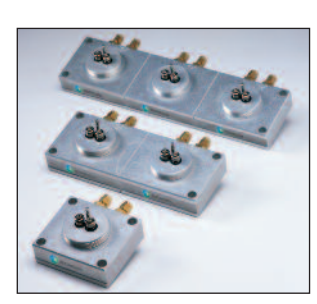
Several baseplate designs allow multiple purifier configurations to customize a specific system for your application