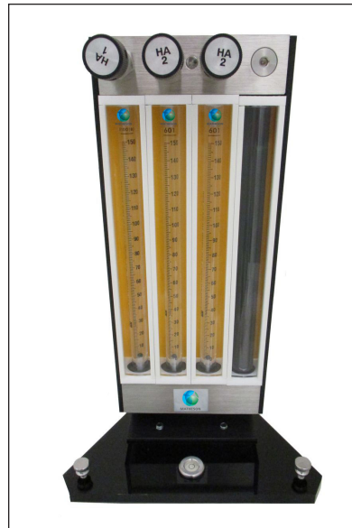
Model 7400 Series