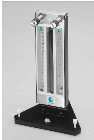
Model 7300 Series