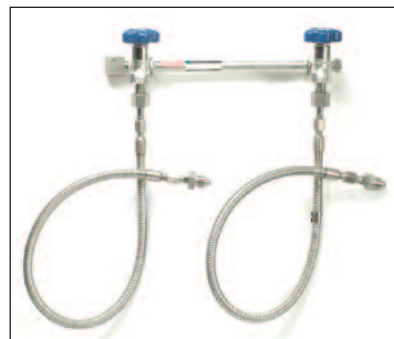
The SourceTrak™ Manifold System