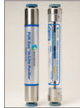
PUR-Gas™ Purifier Systems