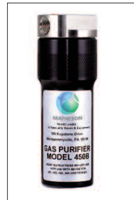
Model 450B High Pressure / Low Capacity Gas Purifier