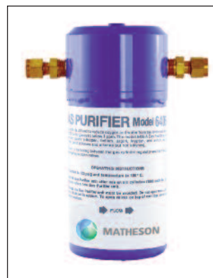
Model 6406 Oxygen Removing Inert Gas Purifier