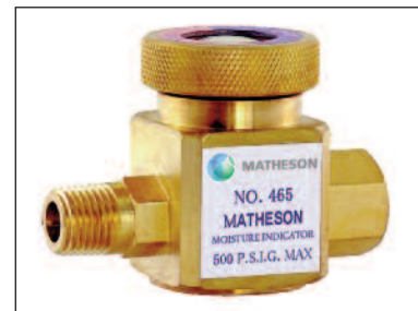
Model 465 Moisture & Impurity Indicator