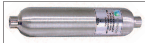
Model 64-1000 Series Oxygen Removing Hydrogen Purifier